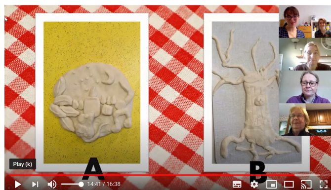
Judging the salt dough for the Primary Variety Show