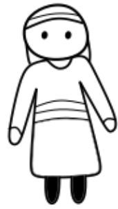
The Temple Assistant