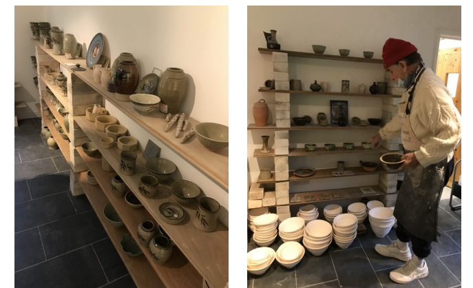
Inside Lansdown Pottery

All the Trustees would like to thank you for your continued support of ICE and we wish each and everyone of you a very blessed Christmas and a Happy New Year!